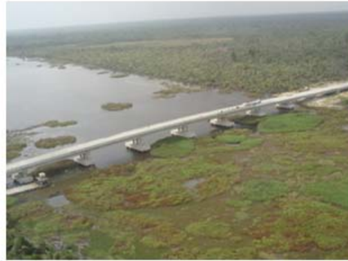
Newly build road and bridge linking OKFTZ to the Benin City express way. 新建的柏油炉和桥梁直接通往贝宁城高速公路

At the backside of the Zone, the Zone is connected via the Creek to Lagos . A newly built jetty allows barges to dock and to unload goods in the area. This inland waterway transportation system offers an additional advantage to the congested roads and port of Lagos.